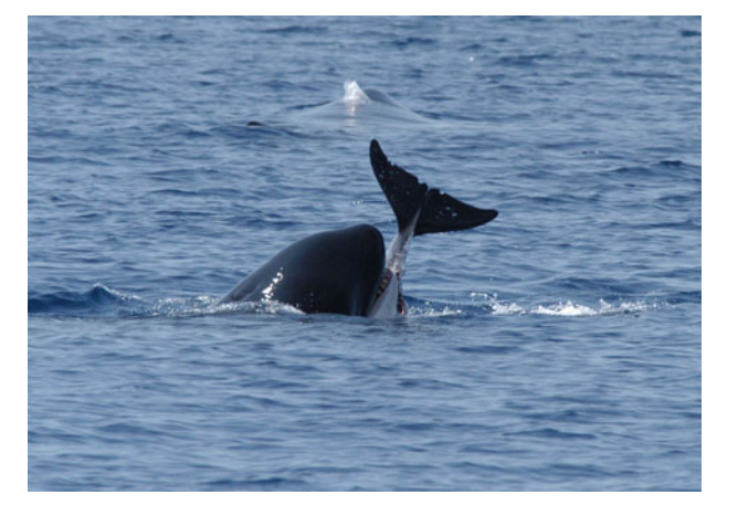
Fig. 2. A young killer whale with a dwarf sperm whale ( Kogia sima ) in its mouth off Abaco, the Bahamas (sighting 21, 27 July 2005).

In 2009, a group of four killer whales approached a group of seven sperm whales ( Physeter macrocephalus ) containing a